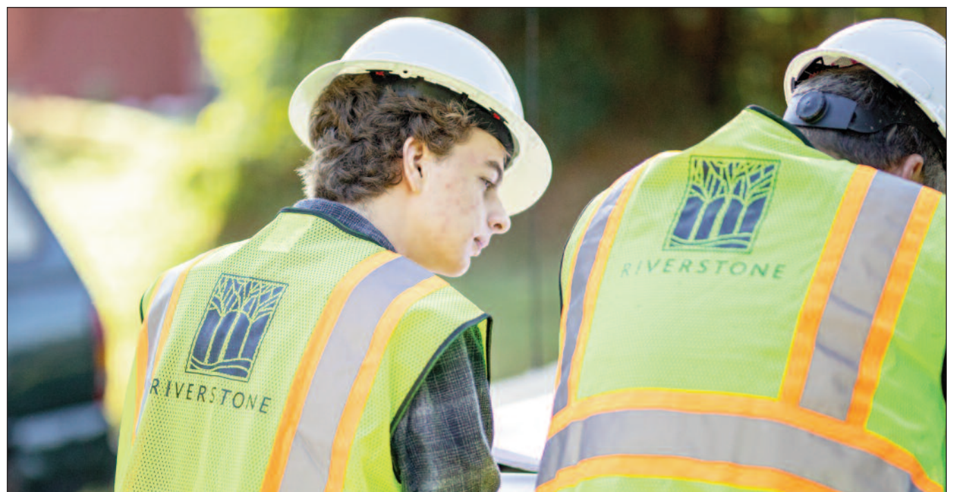
Riverstone Crew Members on a Job Site

One of Riverstone's most famous renovations is on Roseneath Road in the Scott's Addition area of Richmond, Virginia. The 9 month schedule consisted of site work, new property utility lines, completely new MEP systems, roofing & coping cap systems, interior renovations, tenant work, windows, entrances and complete exterior architectural upgrades. The total construction budget met $1,500,000 and the project delivered on time.