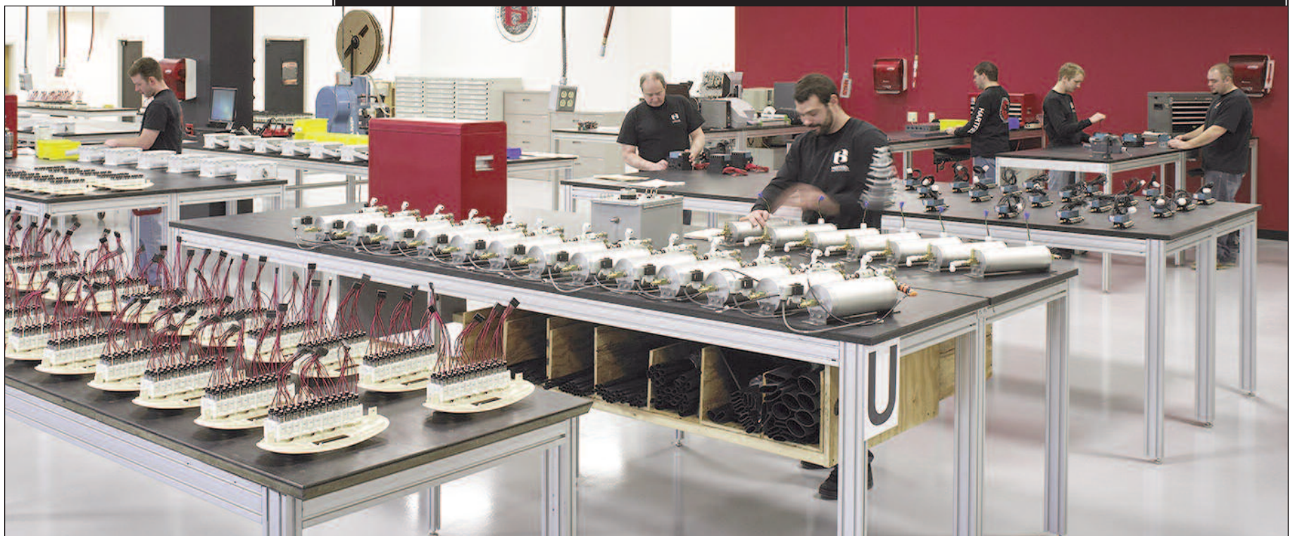
Converting Conveyors to Integrate to One System

Hartfield Automation contacted Riverstone during their move from Fredericksburg to Ashland. This call center turned automation facility features a training room, large break room, and a robotics room with epoxy flooring. This project highlighted our capacity to change the dynamics of a space to ensure MEP efficiency.